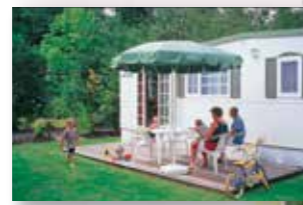
Luxurious caravans for rent