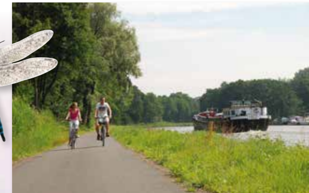
Biking along the canal Dessel – Schoten