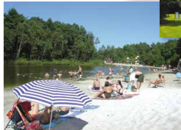
Swimming lake and beach