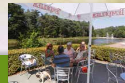
Tavern with view on the swimming lake