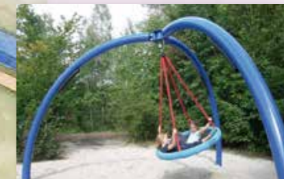
Playing and climbing