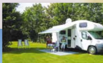
Pitches for motor homes