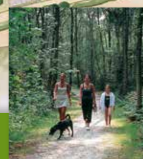
Walking in the woods